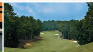
Neighborhood Country Club